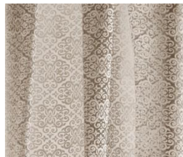
83605 COL. 50