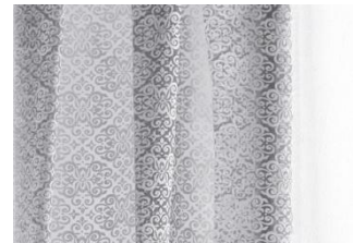
83605 COL. 60

Laize - Width - Breite - Altezza : 280 cm